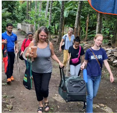
On the way to sign language class