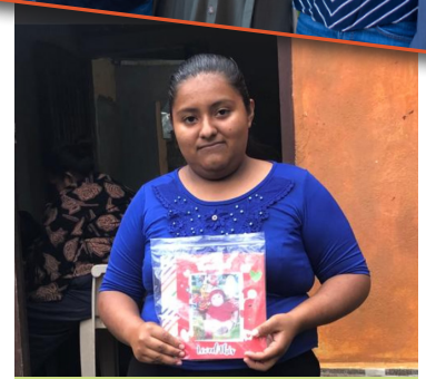
So many smiles from beginning to end!

"You yourselves are our letter, written on our hearts, known and read by everyone. You show that you are a letter from Christ, the result of our ministry, written not with ink but with the Spirit of the living God, not on tablets of stone but on tablets of human hearts." 2 Corinthians 3:2-3